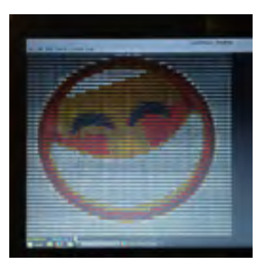
Hackers & Designers Summer Academy 2016 – Modem workshop