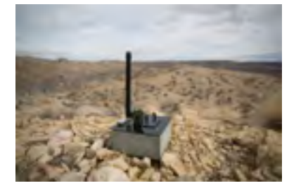
Gottried Haider – Study for a Camera on a Plot of Land in the Desert